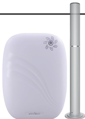
S80 | S100